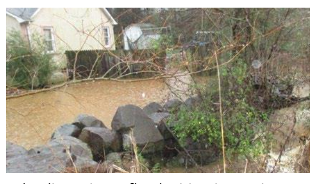
Flooding prior to flood mitigation project - September 2019 Newsletter

solution saved the City of Rock Hill nearly $500,000 from the original budgeted construction amount. The implementation of the project was also simple enough that City crews were able to construct and implement the proposed themselves. improvements Construction on the project