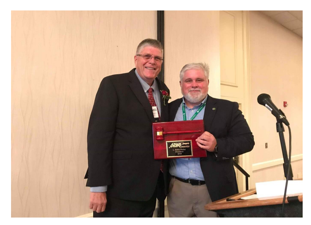
2019 NC Annual Conference – President's Award

ii. The Equipment Services Division and the Streets Division hosted a combined conference from September 25th – 27th at the Wilmington Convention Center in Wilmington, NC. The conference was a huge success with a record number of attendees. The following awards were presented at the conference: