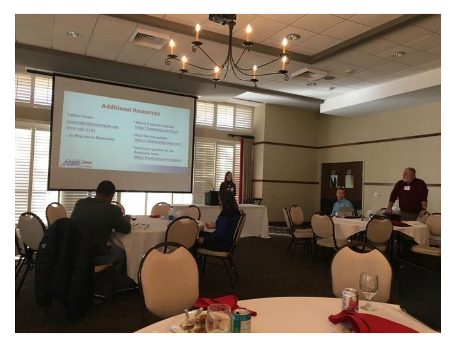
Basecamp Training at 2019 Leadership Training Conference

• The Chapter continues to use Basecamp as a way of keeping all the information associated with the Chapter in one repository. This platform is allowing the Chapter to keep-up with critical information as well as share it with all the members of the Executive Board. The Chapter is also continuing to use Helms Briscoe in planning conferences. Helms Briscoe works with the various Division Boards to identify venues and aid in negotiating a contract for room rates, the number of hotel rooms needed for the event and food for the event. The Chapter has been able to continue to grow membership by taking advantage of the first-time member's rate offered by APWA national and adding this cost along with chapter dues to the conference or workshop member rate to form a non-member rate. Our chapter then takes the necessary steps to get these attendees registered as APWA members.