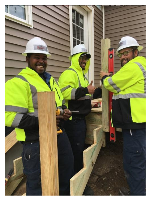
Habitat for Humanity Build

ii. The Town of Wake Forest, including members from the APWA NC Chapter worked to build homes with Habitat for Humanity on November 7, 2019. Three houses were worked on within the town limits. Some of the things done included applying siding, building decks, & making door frames.