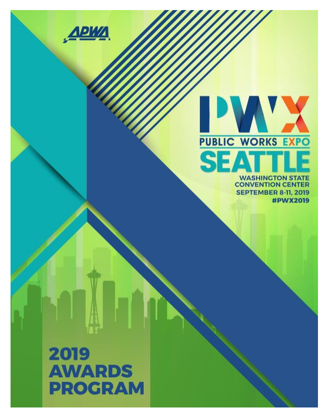
PWX 2019 – Seattle, WA