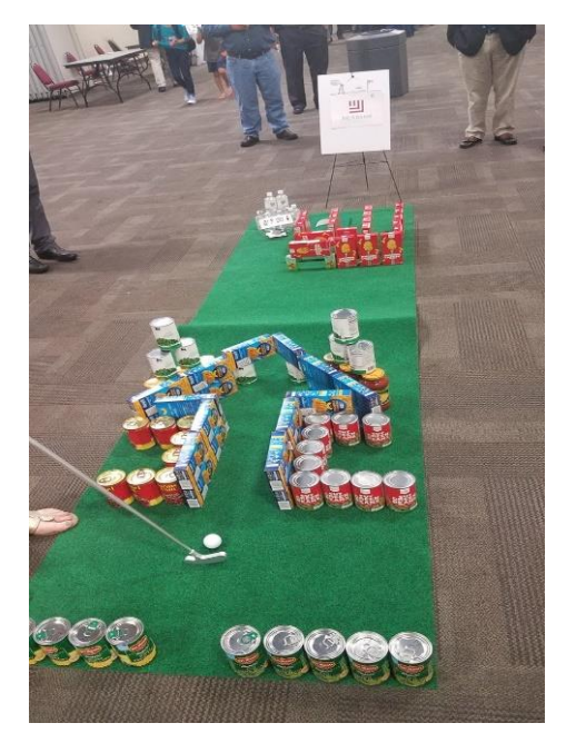
2019 State Chapter Putt-Putt Food Drive

ii. The Town of Wake Forest, including members from the APWA NC Chapter worked to build homes with Habitat for Humanity on November 7, 2019. Three houses were worked on within the town limits. Some of the things done included applying siding, building decks, & making door frames.