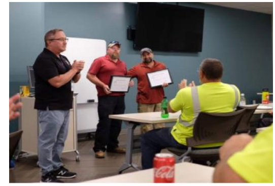
Kernersville NPWW Celebration

"Celebrating Employees during National Public Works Week in Kernersville". The Department's 56 employees celebrated the event by enjoying a lunch of hamburgers, hot dogs and many traditional picnic sides. The culmination of the luncheon was desserts prepared by The Ice Queen Parlor Food Truck from