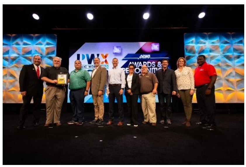
Members from the North Carolina Chapter accepting the PACE Award at the 2019 PWX Conference in Seattle

With momentum from 2018, the Chapter maintained effective leadership and approached the year with enthusiasm and an ambitious plan for the year. The previous year paved the way with a focus on incorporating sustainability principles into trainings and workshops, which continued in 2019. The leadership put focus on Chapter involvement, volunteering, continued growth, and member opportunities.